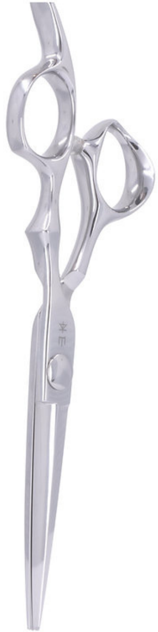
IVY ANN BARBER CUTTER SIZES: 5.5 IN , 6.0 IN PRICE: $985