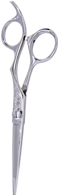
SIGNATURE DAMASCUS SIZES: 5.5 IN , 6.0 IN PRICE: $995