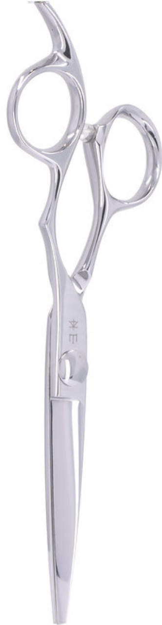
IVY ANN OFFSET SIZES: 6.0 IN PRICE: $895