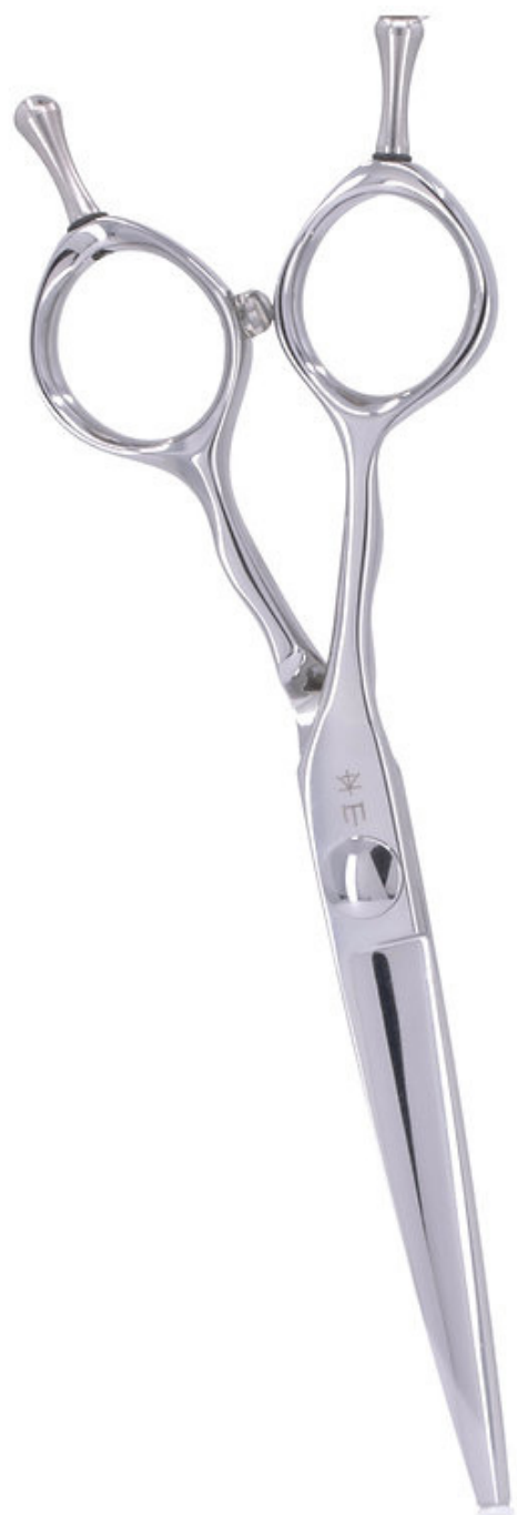
STUDENT CUTTER SIZES: 5.5 IN , 6.0 IN PRICE: $799