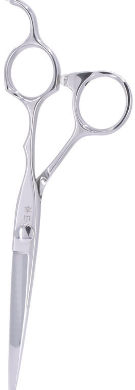
IVY ANN DETAILER SIZES: 6.0 IN PRICE: $895