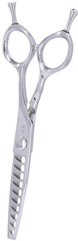
SIGNATURE 60% TEXTURIZER SIZES: 6.0 IN PRICE: $1095