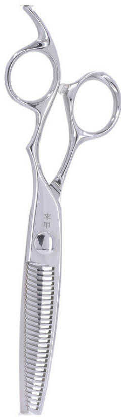
SIGNATURE 30% TEXTURIZER SIZES: 6.0 IN PRICE: $1095