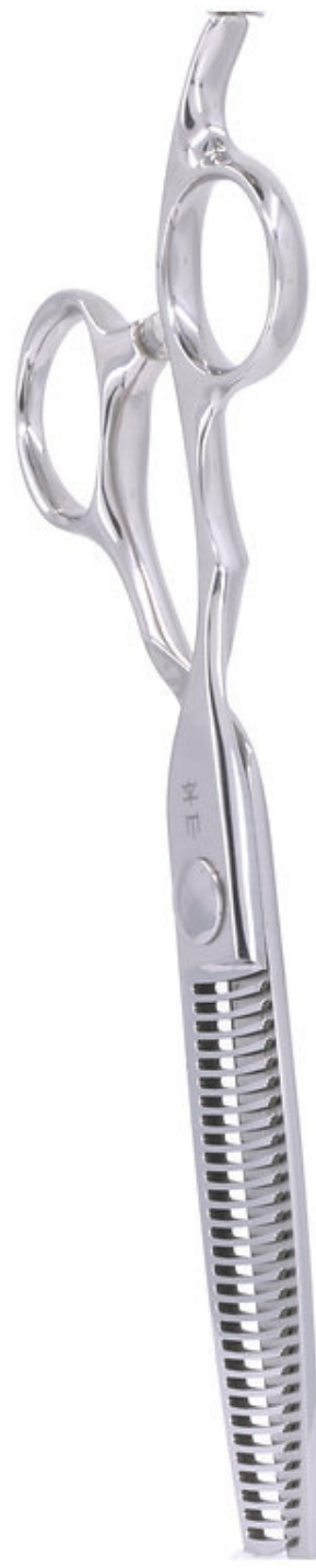
LEFTY 20% TEXTURIZER SIZES: 6.0 IN PRICE: $1095