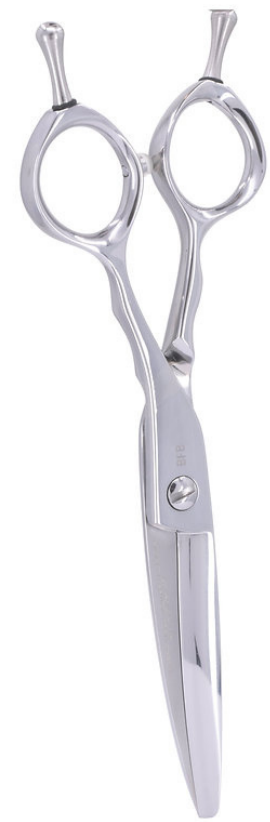
SIGNATURE DRY CUTTER SIZES: 6.0 IN PRICE: $985