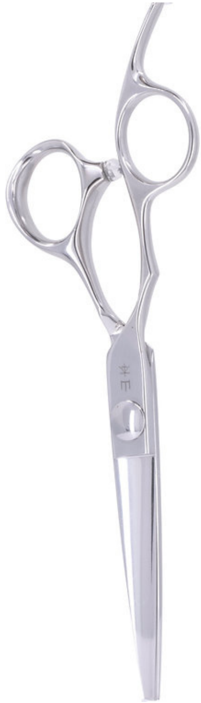
LEFTY CUTTER SIZES: 5.5 IN , 6.0 IN PRICE: $895