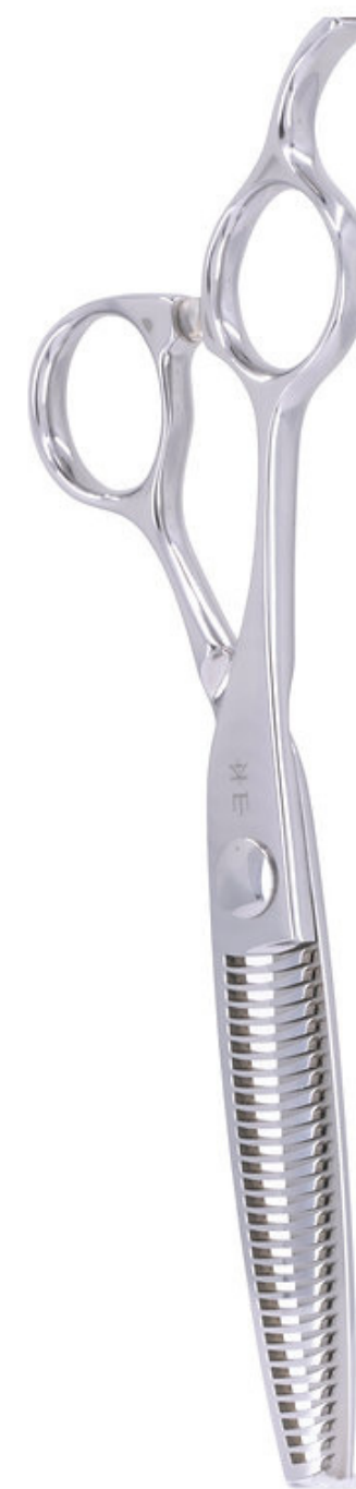
STUDENT LEFTY 30% TEXTURIZER SIZES: 6.0 IN PRICE: $895