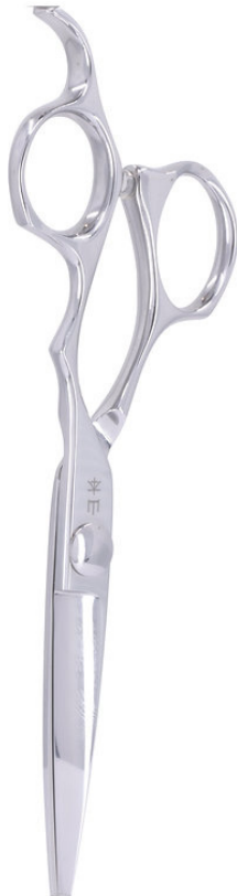
SIGNATURE OFFSET SIZES: 5.5 IN , 6.0 IN PRICE: $950