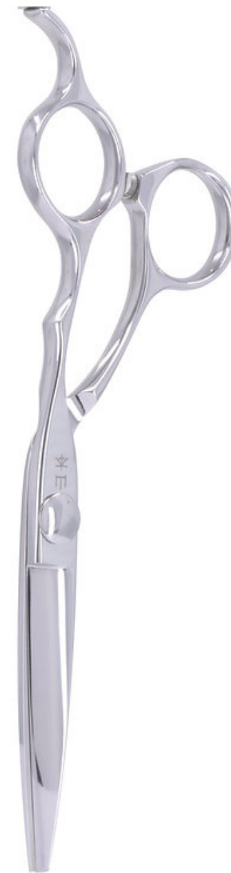
IVY ANN CRANE SIZES: 6.0 IN PRICE: $895