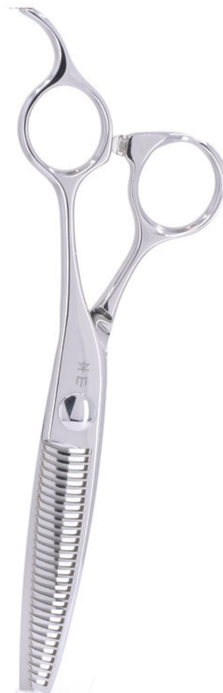
STUDENT 30% TEXTURIZER SIZES: 6.0 IN PRICE: $895