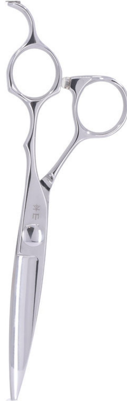
IVY ANN SLIDE CUTTER SIZES: 6.0 IN PRICE: $895