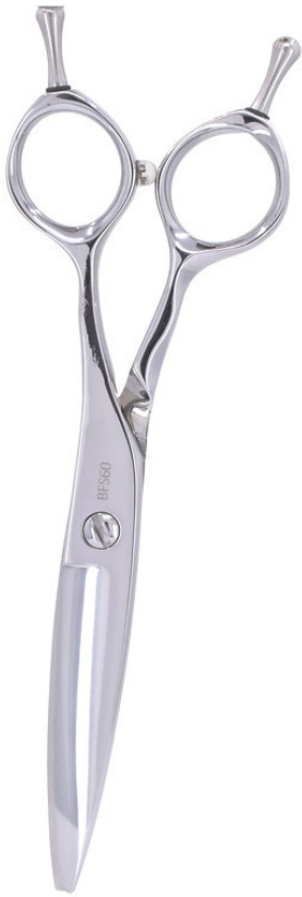
SIGNATURE SLIDE CUTTER SIZES: 5.7 IN , 6.2 IN, 6.7 IN PRICE: $985