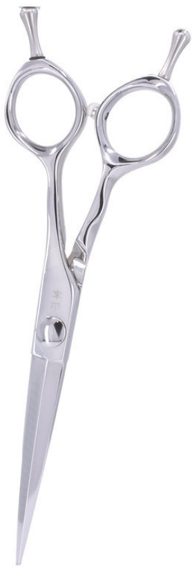
SIGNATURE SWORD SIZES: 6.0 IN PRICE: $985