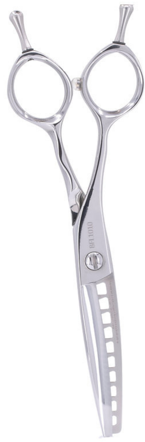
LEFTY 60% TEXTURIZER SIZES: 6.0 IN PRICE: $1095